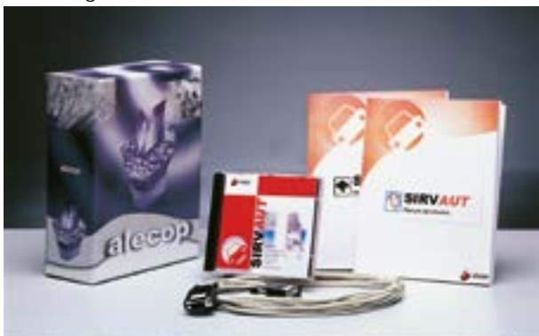
SIRVAUT Software integrated into the equipment.