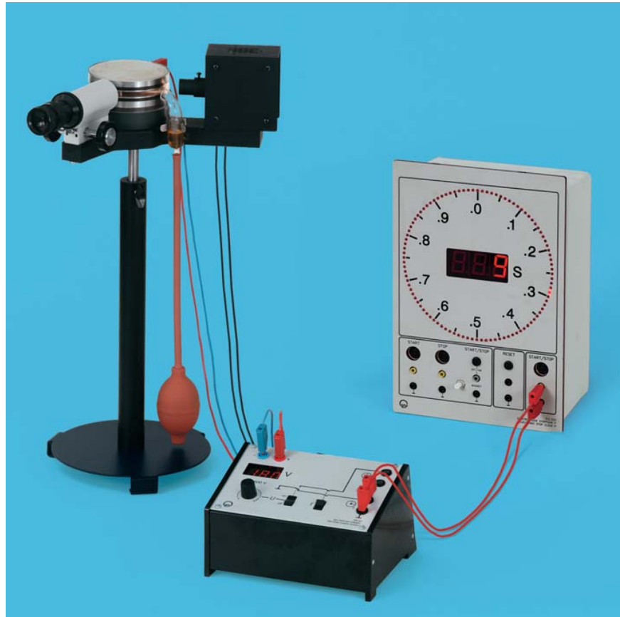
Determining the electrical charge of the electron after Millikan and demonstrating the quantum nature of the charge – measuring the suspension voltage and the falling speed (P 6.1.2.1)

With his famous oil-drop method, R. A. Millikan succeeded in demonstrating the quantum nature of minute amounts of electricity in 1910. He caused charged oil droplets to be suspended in the vertical electric field of a plate capacitor and, on the basis of the radius r and the electric field E , determined the charge q of a suspended droplet: