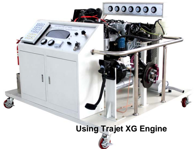
Using Trajet XG Engine